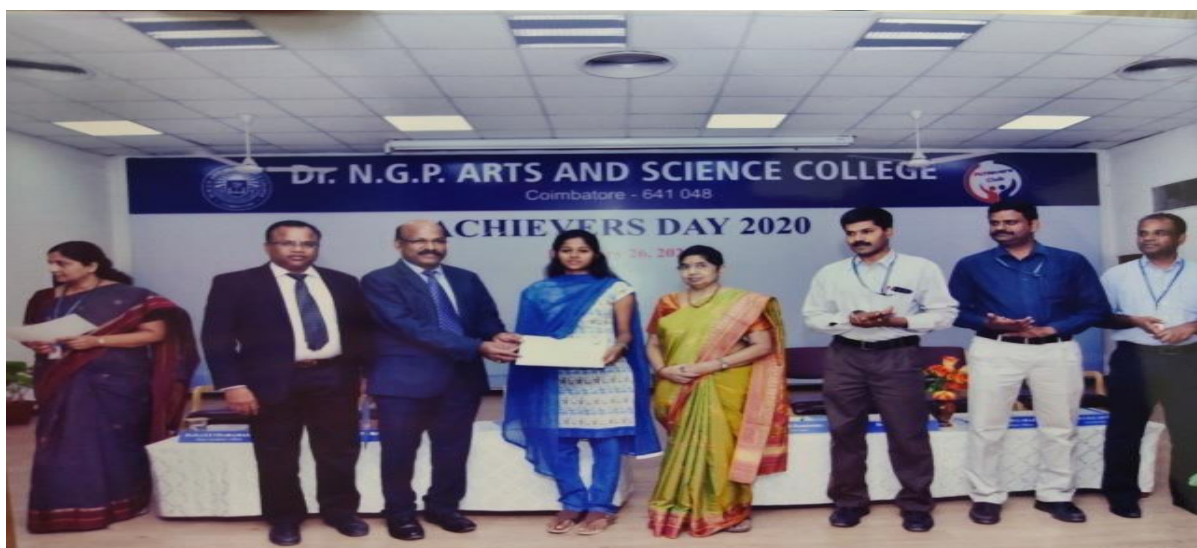
Achievers Day on 26.02.2020

Achiever's day on behalf of Achievers Club is celebrated to cherish and recognize various accomplishments by the teaching and non-teaching staffs, students and the departments. The management and Principal provide us a chance to recognize all the Achiever's. The achievers are selected under various categories which includes: Our post graduate aspirants have also acquired Admissions from various universities round the Globe, Our students have cleared various competitive exams including Common Proficiency Test (CPT), ACS (Associate Company Secretary), CMA (Certified Management Accountant), Our Faculties have also topped in NET (National Eligibility test), SET (State Eligibility test) and NPTEL (National Program on Technology Enhanced learning), The best of students, Faculties, Research papers, Research fellowships and young scientist, entrepreneur startups from young entrepreneurs, The Shine and the glow of our stars has also reflected in inter college events and District/State/National/International level competitions are recognized and due to be awarded. The best departments from each Faculty have been adjudged. As a result of enriching the work of teaching and non-teaching staff, best performers have been recognized and are to be cherished.