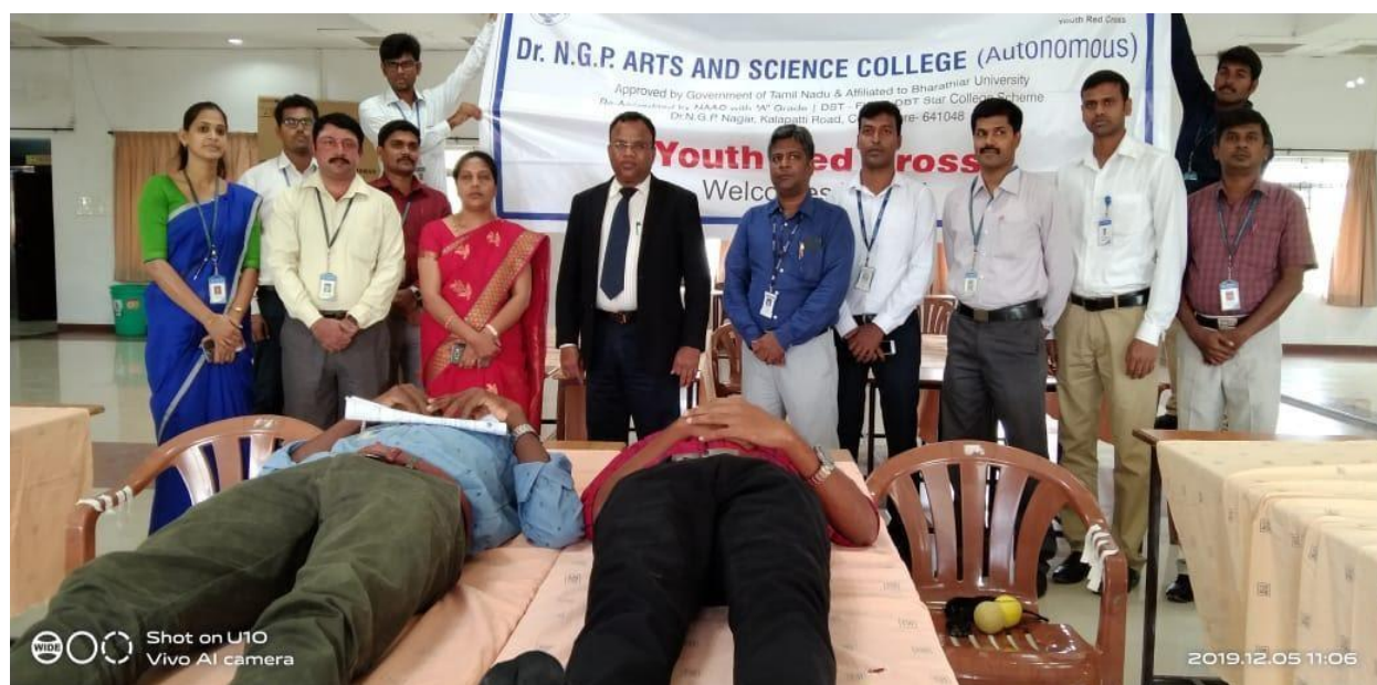
Grouping and Blood Donation on 05.12.2019