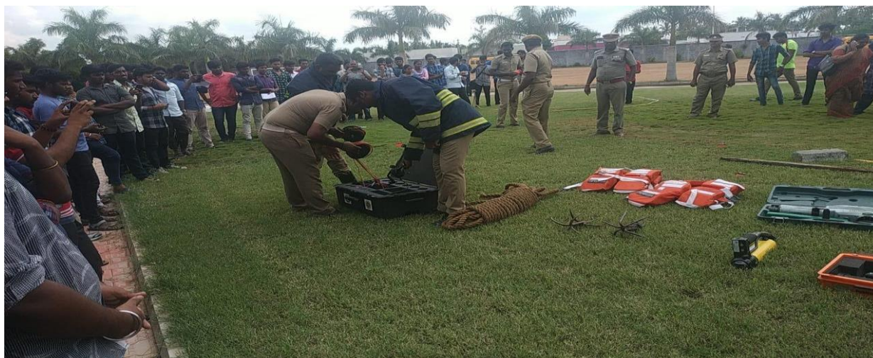
District Disaster Response Training programme at Adithya International School, Coimbatore, from 27.09.2019 to 01.10.201

District Disaster Response Training programme is conducted by Indian Red Cross Society for the young active, energetic and ready to serve YRC volunteers group in the colleges forming the very foundation of the Red Cross movement in the grass root level. This programme is conducted at Adithya International School campus from 27.09.2019 to 01.10.2019. In this programme YRC volunteers are nominated by the college to undergo training who have excelled in their Red Cross activities with dedications, commitment, enthusiastic involvement, sacrificing nature and service mind. In this training programme 3 YRC volunteers with 1 Staff member undergone training for 5 days.