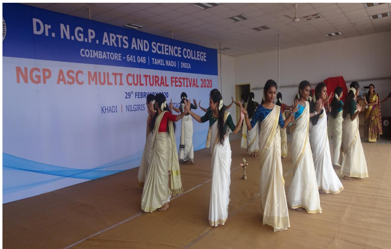
Multicultural Festival- 2020 - Kerala Heritage on 29.02.2020