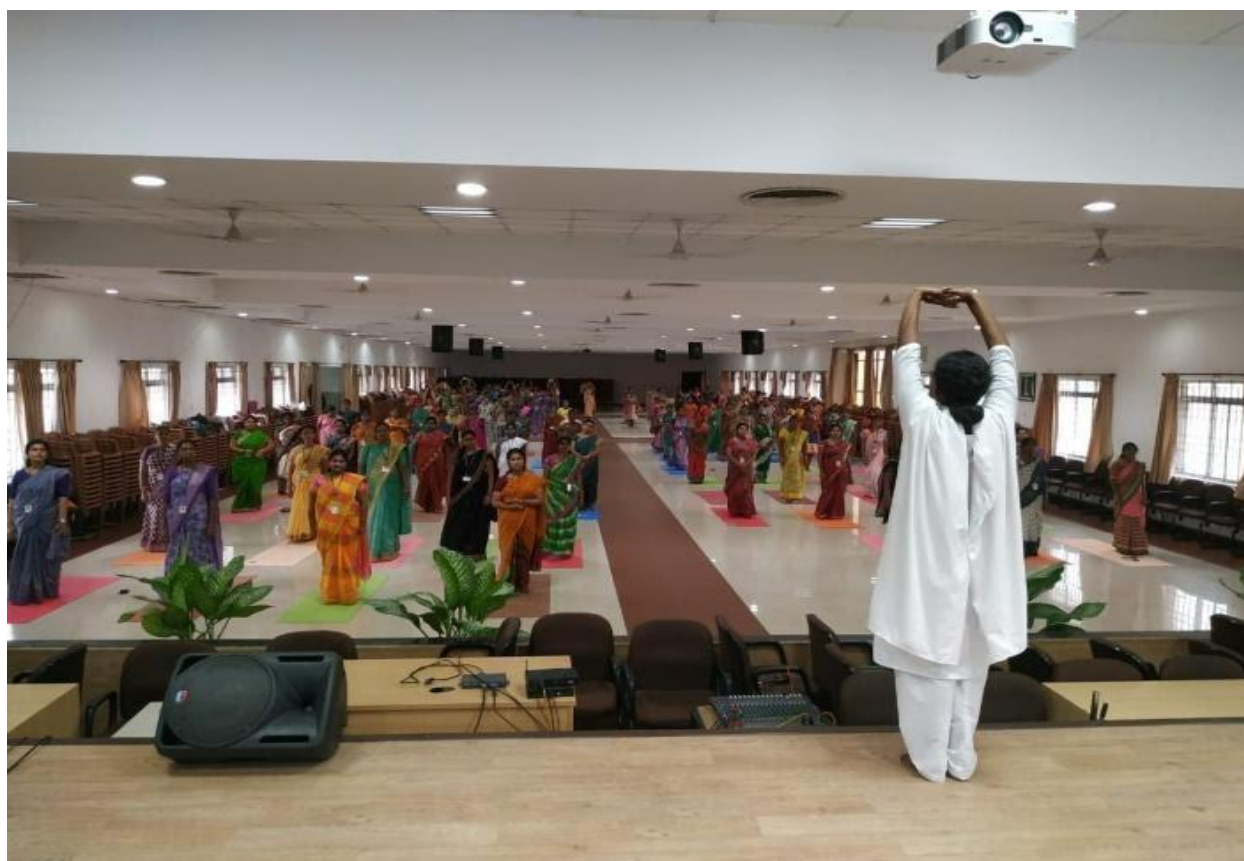
Stress Relief Workshop for Female Faculty – 11 th & 12 th July 2019