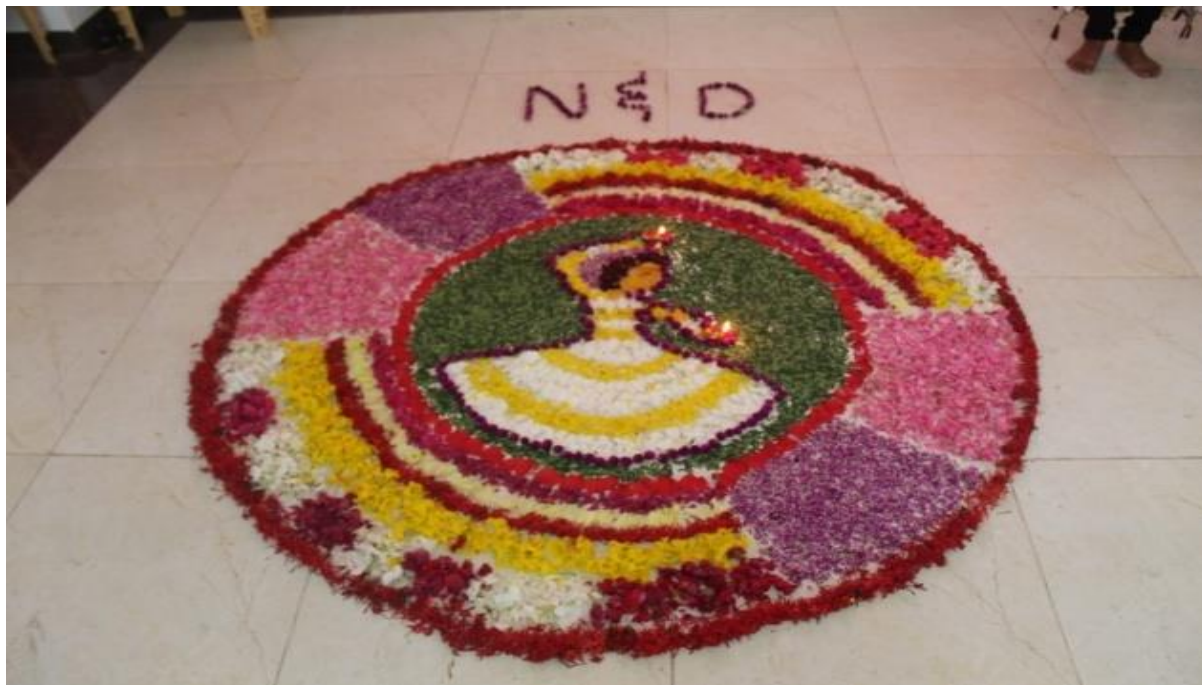
Pookolam Competition – Onam Celebration on 07.09.2019