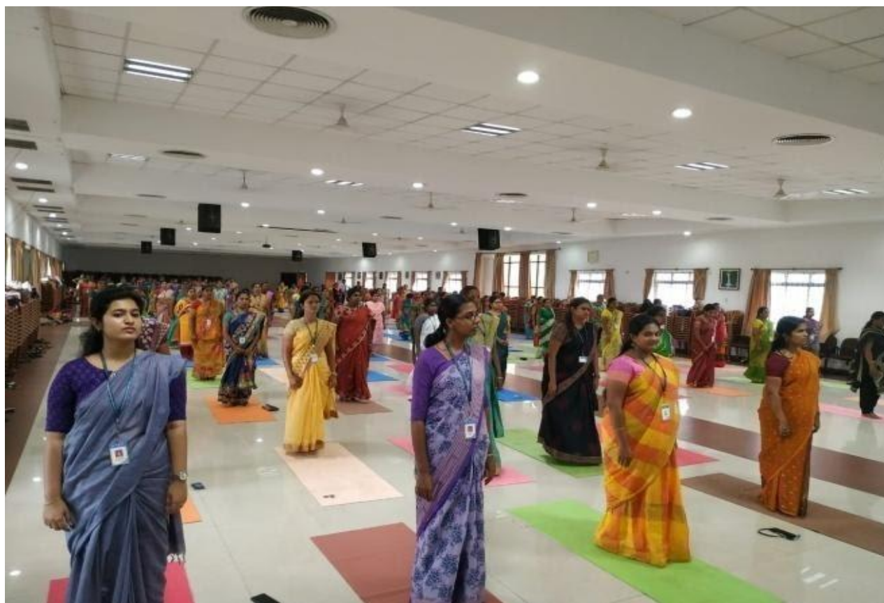
Stress Relief Workshop for Female Faculty – 11 th & 12 th July 2019