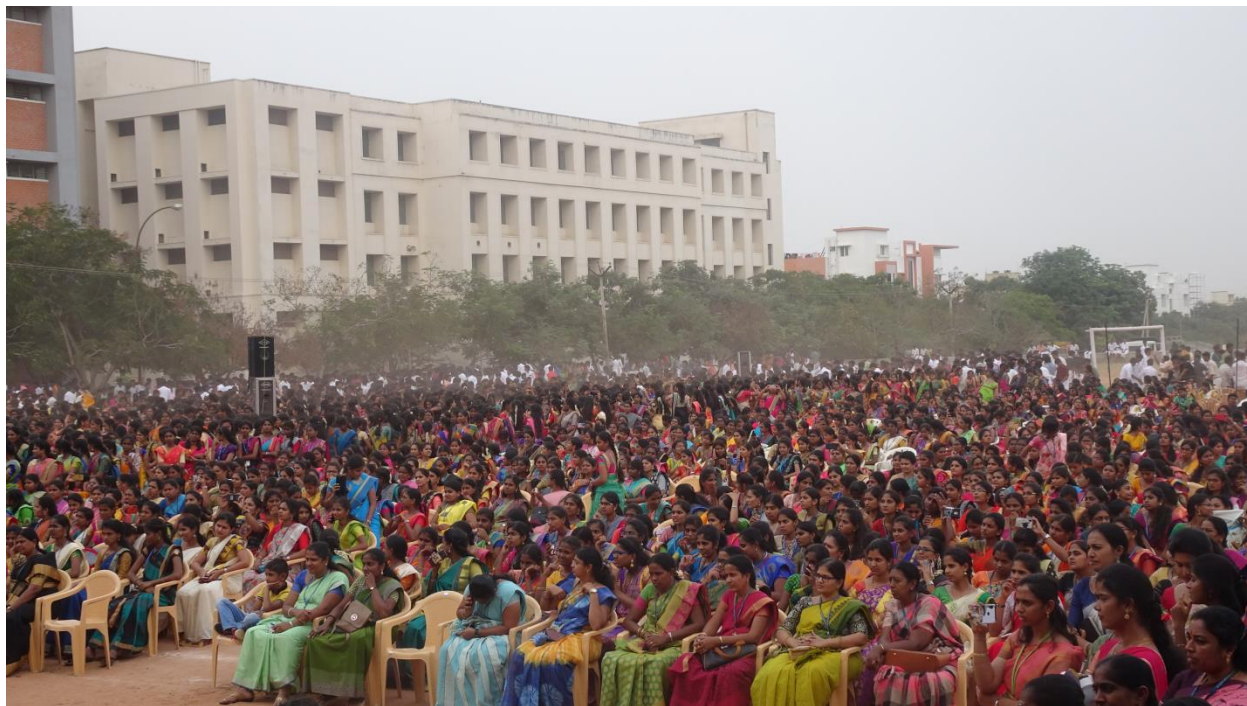
Multicultural Festival- 2020- witnessing of the mass gatherings on 29.02.2020