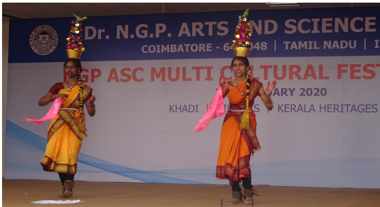
Multicultural Festival- 2020- Khadi Heritage on 29.02.2020