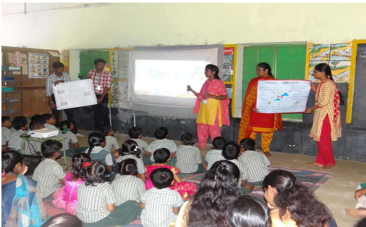
Skill based computer training at karuparaiyanpalayam on 01.02.2020

Extension is an important activity which contributes to the enhancement of the status and public recognition of a profession and welfare of the society at large. Keeping this view in mind the Computer Science students of Dr. N.G.P. Arts and Science College provided skill-based training at karruparaiyanpalayam on 01.02.2020 with the view to enhance their skills in basics of computer