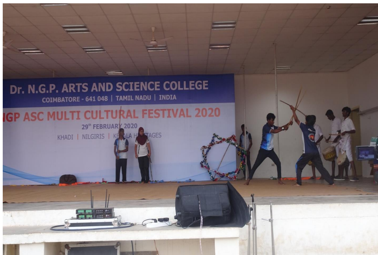
Multicultural Festival- 2020 on 29.02.2020