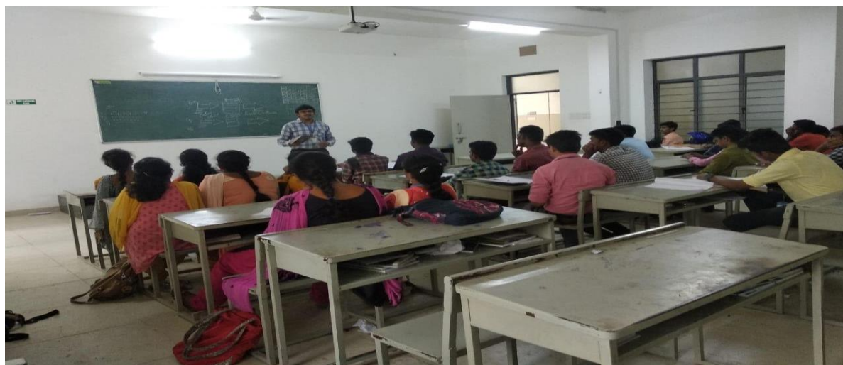
Activities of 60/60 Club 19.07.2019

The 60/60 Club of Dr. N.G.P. Arts and Science College was initiated by the Department of English in the academic year 2012-13. The club aims to develop the communicative skills of the students from vernacular medium Background. The club is designed for the students of 60 boys and 60 girls from Vernacular medium. The club aims to enhance the LSRW Skills of the Vernacular Medium students. Besides, this club also encourages the students to face the society with confidence