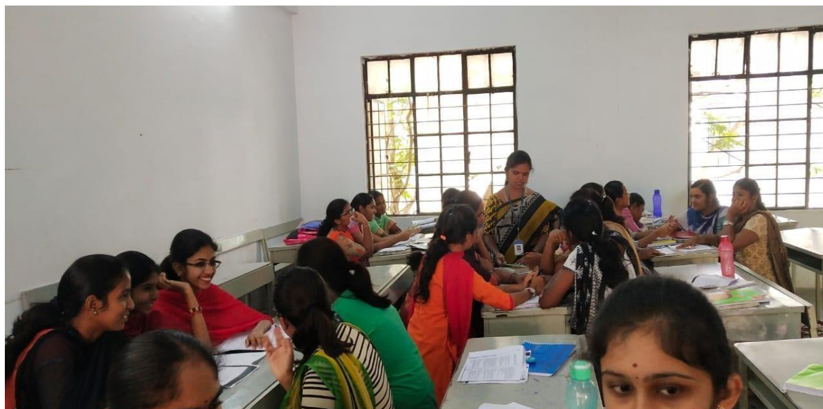
BEC Mock Test Preparation on 24 th September 2019

Center for Language Learning provides communication training to the students of all disciplines. The training for this course is provided by the Center for Language Learning to the students of various disciplines. The course started by conducting a Screening test in the month of July and the classes were conducted from the month of July. Nearly two hundred and forty students enrolled themselves for this course. Students were trained with the help of various teaching aids and also they were made to take up many Mock Tests prior to the exam. A one day Orientation from British council was given to all the first year UG students which gave a complete course details and its merits at the first session and later British council also gave an Orientation for the staffs in the second session in 3 rd of September. Later Screening test was conducted for all other department UG students who wish to take up BEC course at various levels at the month of September were around hundred and fifty students enrolled themselves of the course at for various levels soon the results were also announced. The department is planned to start the classes for BEC general students from 24 th of September 2019 who will later take up the final exam of BEC at the month of March.