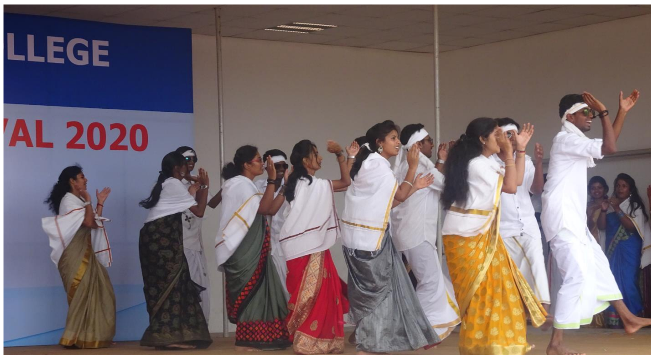
Multicultural Festival- 2020 – Nilgiris Heritage on 29.02.2020