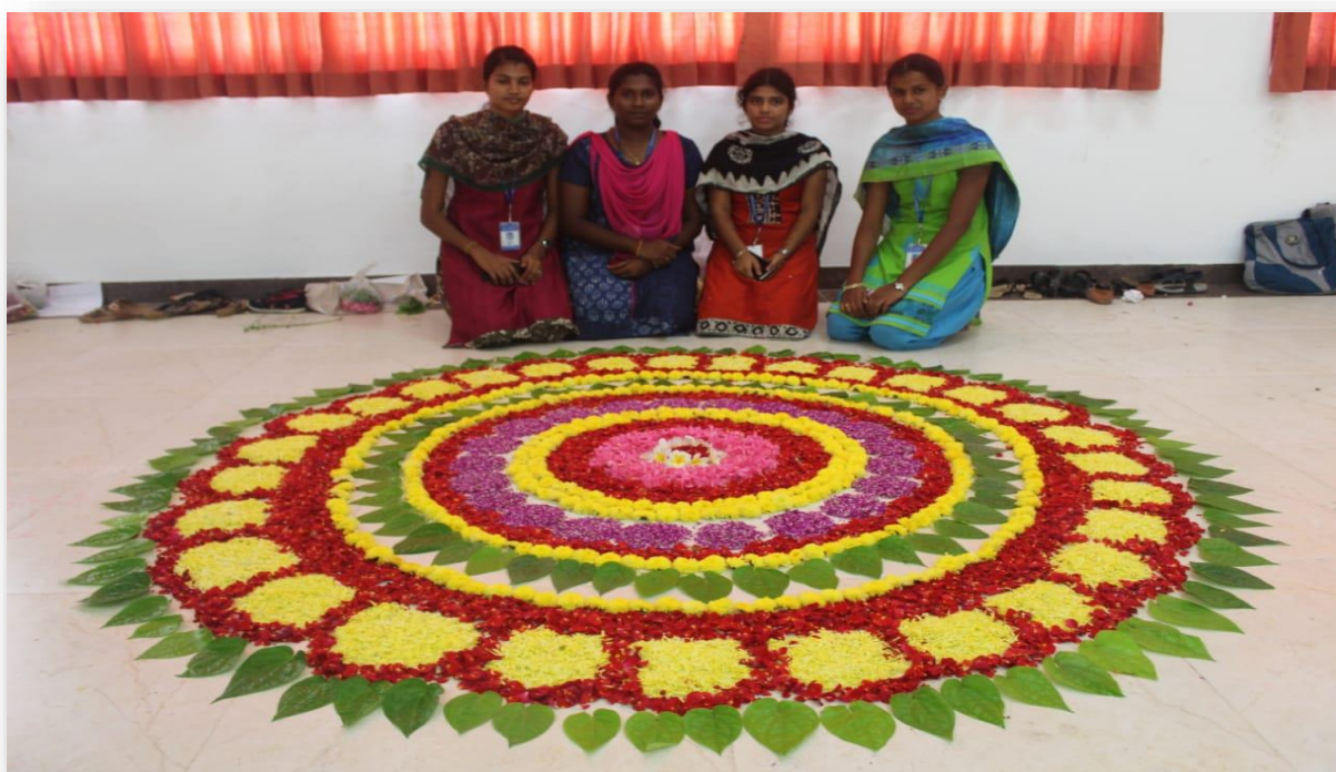
Pookolam Competition – Onam Celebration on 07.09.2019

Onam festival is celebrated to honour the kind-hearted and much-beloved demon King Mahabali, who is believed to return to Kerala during this festival. According to Vaishnava mythology, King Mahabali defeated the Gods and began ruling over all three worlds. King Mahabali was a demon king who belonged to the Asura tribe. As a part of Onam Celebration Pookolam Competition was conducted for the students. The Pookalam consists of ten small round steps. The ten steps or rings are believed to represent ten different deities in Hinduism each day of the 10-day Onam festival used to be represented on the Pookalam.