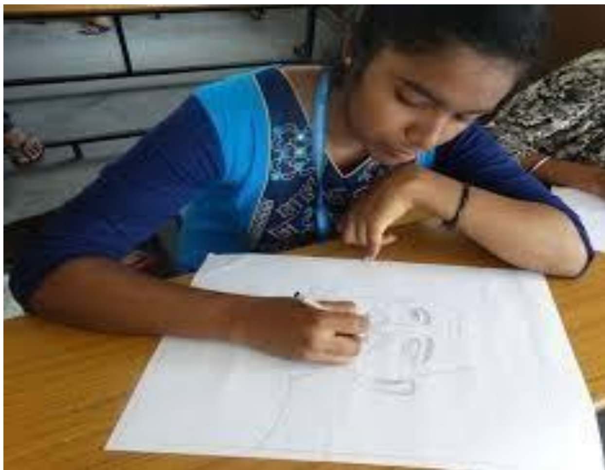
Pencil Sketch Competition – Dr APJ Abdul Kalam Memorial Day on 27.07.2019