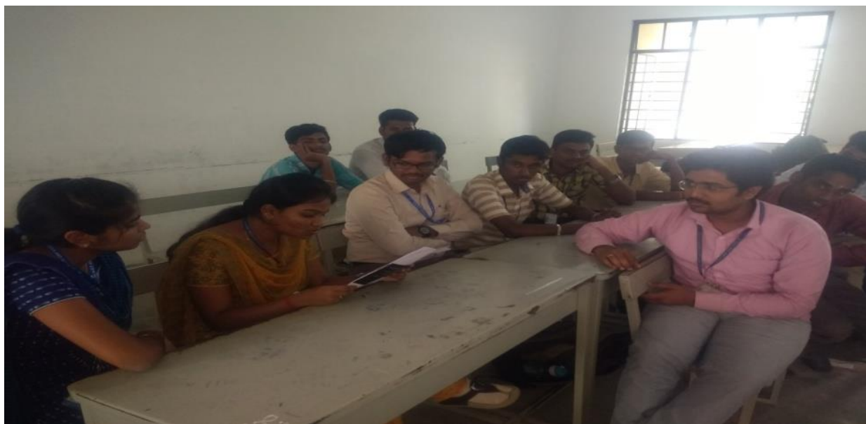
Awareness on drama classroom management on 04.01.2020

The Drama Club promotes drama education and provide variety performances for students. Students are given a great deal of golden opportunities to recognize their talents. Moreover, the club aims to teach them how to appreciate dramatic literature and its techniques, and also help students to attain a better mastery of language. The Drama Club encourages dramatic presentations by students in the form of skits, mime, plays etc. Club also helps to nurture well-rounded individuals by adding the Drama Club, college can cater to the great diversity of students' interests This certainly provides a chance for students to enhance their leadership skills and co-operation spirits, since they need to work hand in hand to run the club, deal with every problems of the club and design plenty of activities.