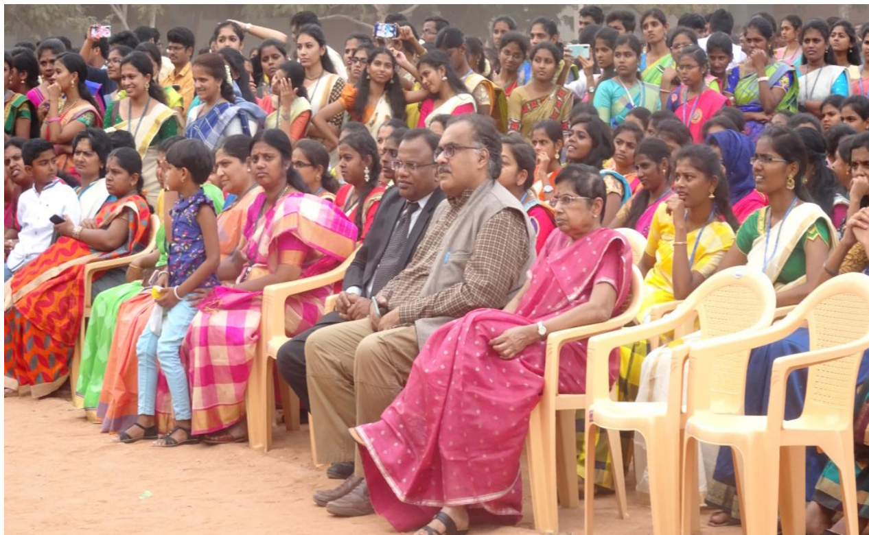
Multicultural Festival- 2020 celebrated on 29.02.2020