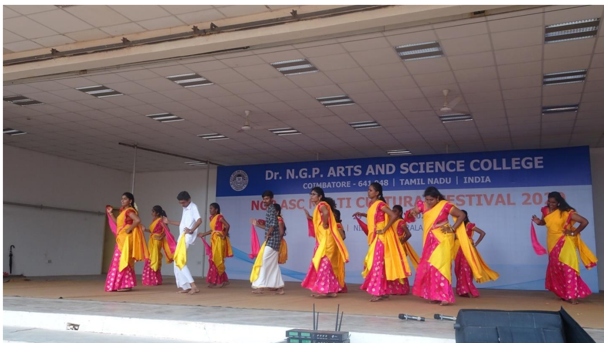
Multicultural Festival- 2020 on 29.02.2020