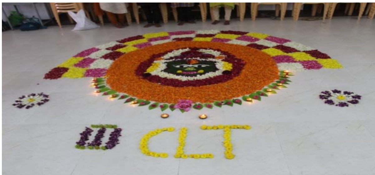
Pookolam Competition – Onam Celebration on 07.09.2019