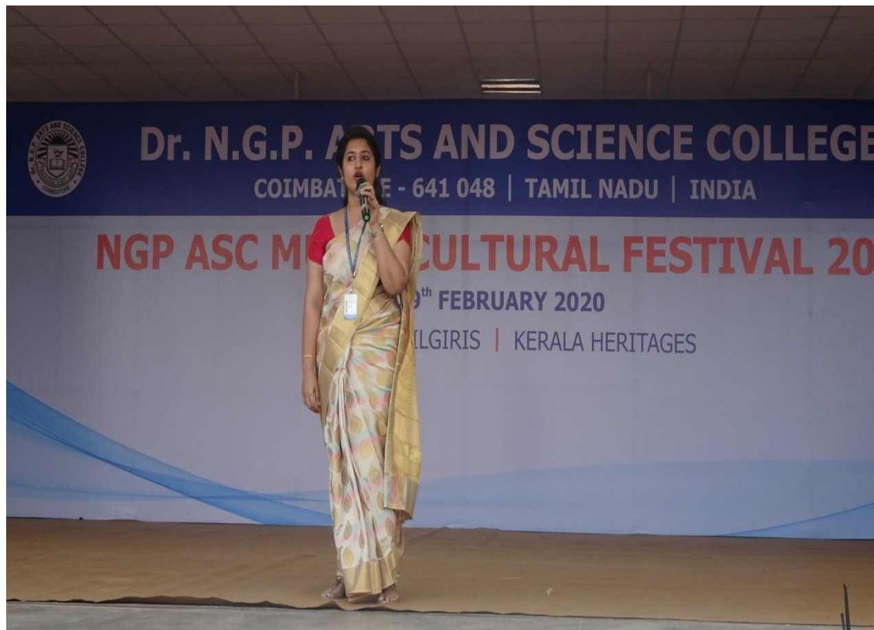
Multicultural Festival- 2020 on 29.02.2020