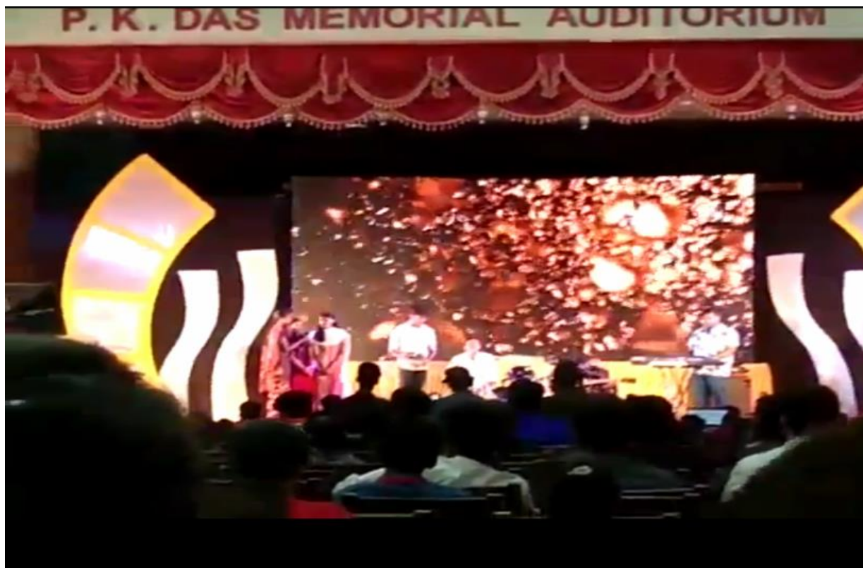
Inter collegiate event “Rockband on 07.02.2020

On behalf of Music club, Students were participated in an Inter Collegiate event “Rockband event” at Nehru College of Management held on 07.02.2020 and the beneficiaries were 7 members.